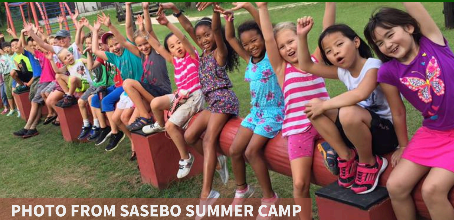
PHOTO FROM SASEBO SUMMER CAMP